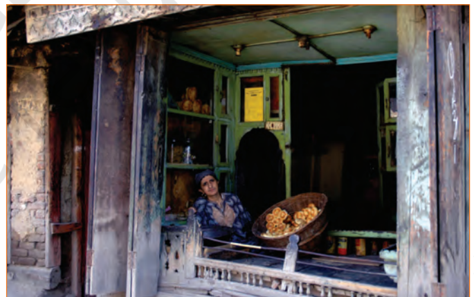
Can you tell what is shown in this picture? Every lane in Kashmir has a bakery. Kashmiri people don't cook roties in their homes, they buy it from such bakeries.

After a long journey Loner and I were about to reach Mumbai. My heart felt heavy. I also felt that my motorcycle did not want to come back. I was happy that I had learnt and experienced so many new things. I had also brought back some memories in my camera. And of course, this was not the end! Next time when Loner and I get bored of the city, we will again set out for a new journey!