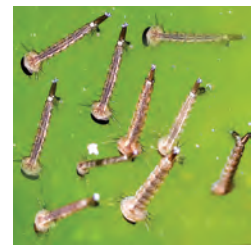
larvae seen through hand lens